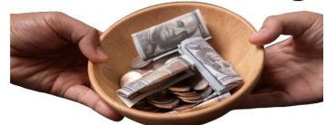
Worship the Lord in Giving