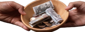
Worship the Lord in Giving